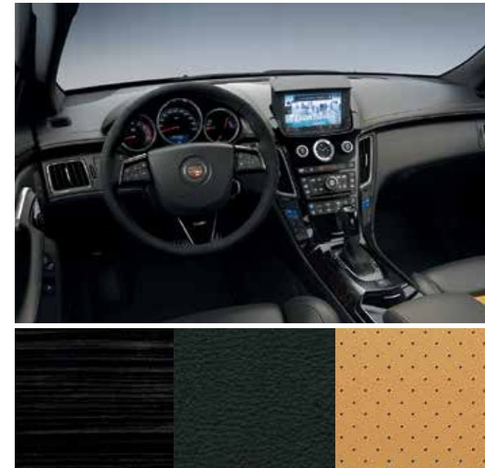
Ebony RECARO® performance seats with Saffron sueded microfiber inserts 4 / Midnight Sapele Wood Trim